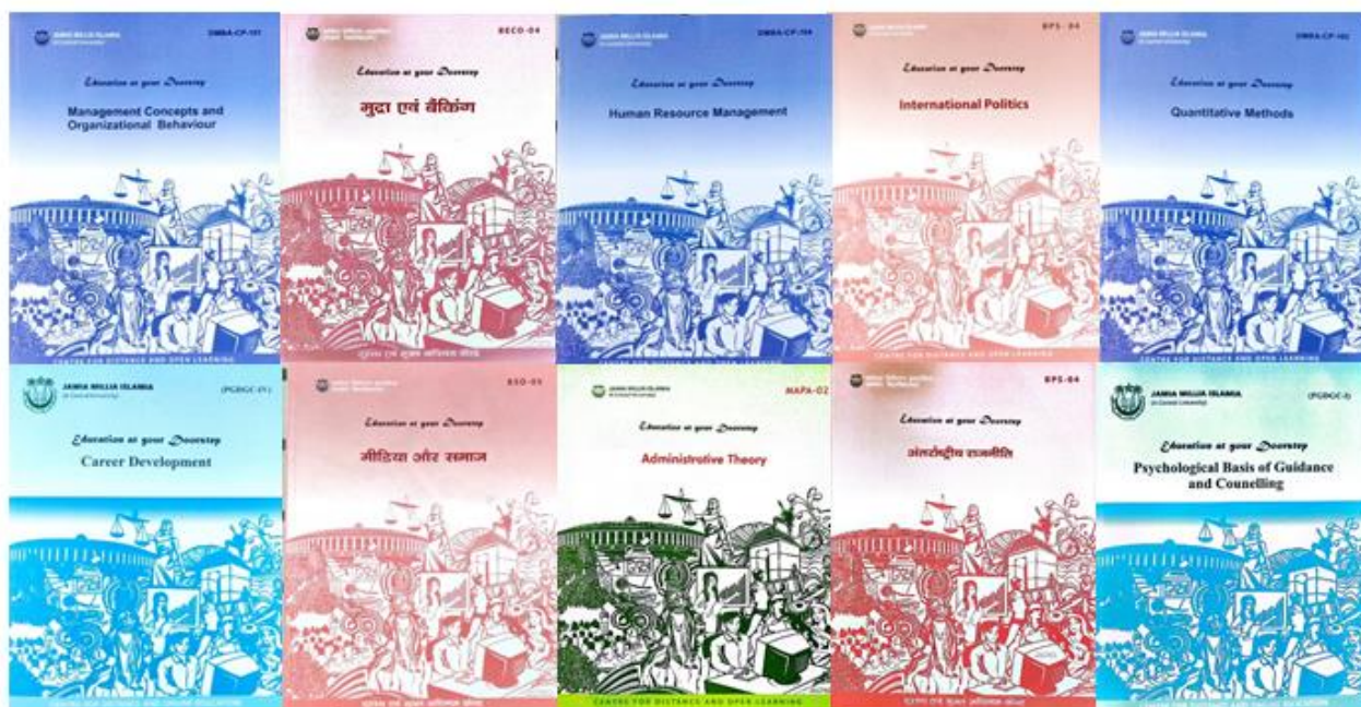
Glimpses of Self-Learning Materials Prepared for Various Programmes